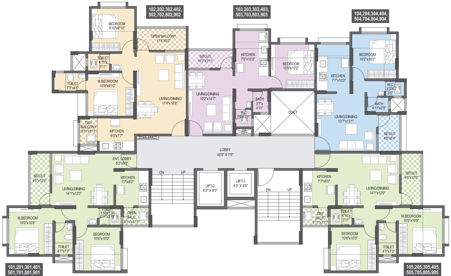
AREA STATEMENT (AREA AS PER RERA)

TYPICAL 1ST, 2ND, 3RD, 4TH, 5TH, 7TH, 8TH & 9TH FLOOR PLAN